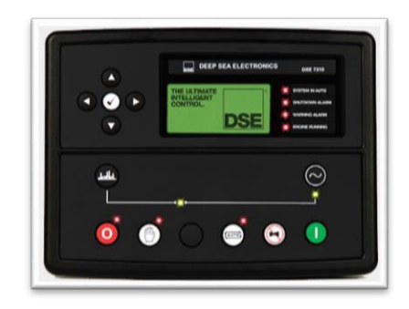
Deep Sea 7310 Control