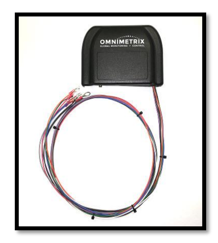
TrueGuard-2 with Data/Power Cable