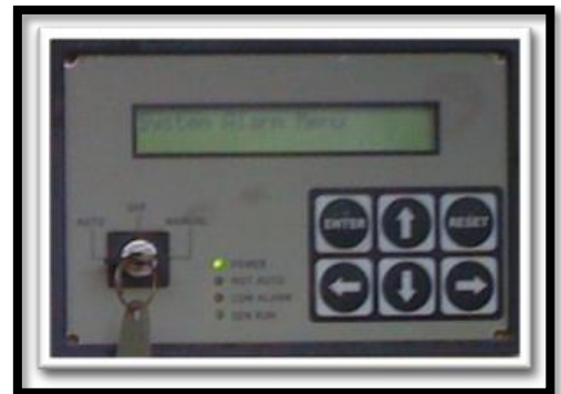
Generac E Panel Controller