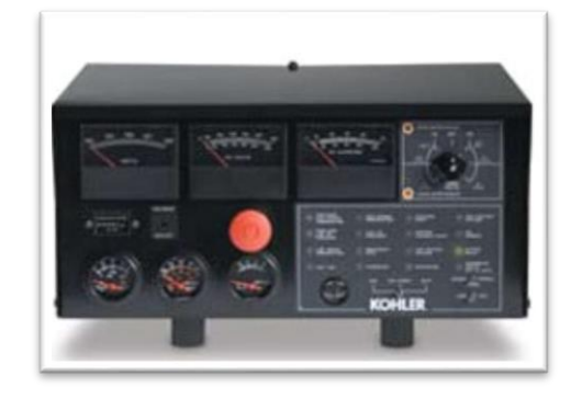
Kohler DEC3 Controller