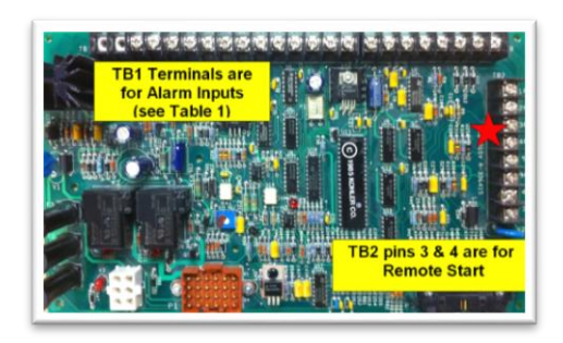
DEC3 Control Board