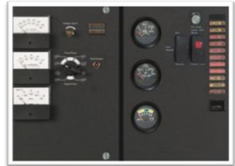
Detector 10 & 12 Controller